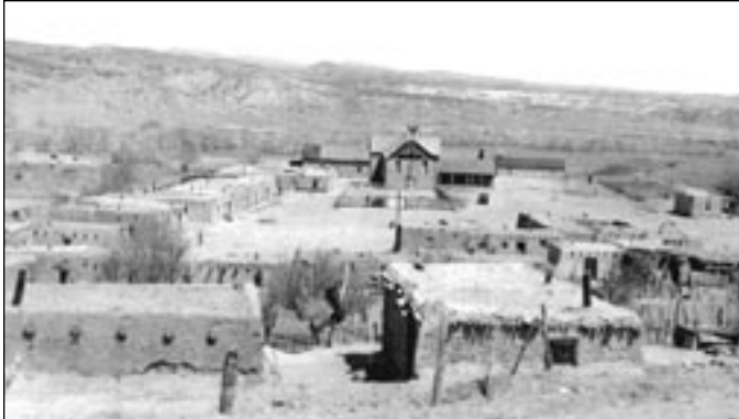
Abiquiu, ca 1800s, #13695